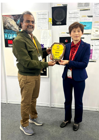
ASGA Print Award 2023 Winners from India ....